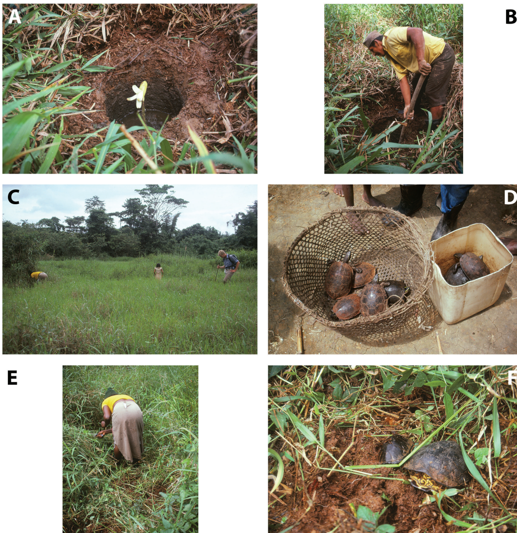
Figure 3. A. A turtle pitfall trap set with a banana. Photo: JE Simmons. B. Our informant is demonstrating construction of a pitfall trap using a small shovel. Photo: JE Simmons. C. A view of people searching the marshy area near Playa Grande. Photo: JE Simmons. D. Containers of turtles caught for us using canastos tortugueros . Photo: JE Simmons. E. Young woman probing for turtles in the marshy area with a machete. Photo: JE Simmons. F. One specimen each of Kinosternon leucostomum and Rhinoclemmys melanosterna sitting on the surface near the spot where they were located by probing—notice the mud on their shells. Photo: JE Simmons.

At Playa Grande, on the Cayapas River, we learned of another active turtle capture technique. This particular village has both Afroecuadorian and Chachi inhabitants and we were instructed jointly in the technique by both ethnic groups. We were taken to a marshy area not far from the river. During the relatively dry season, the marsh had no standing water; however the substrate was wet and spongy and the entire