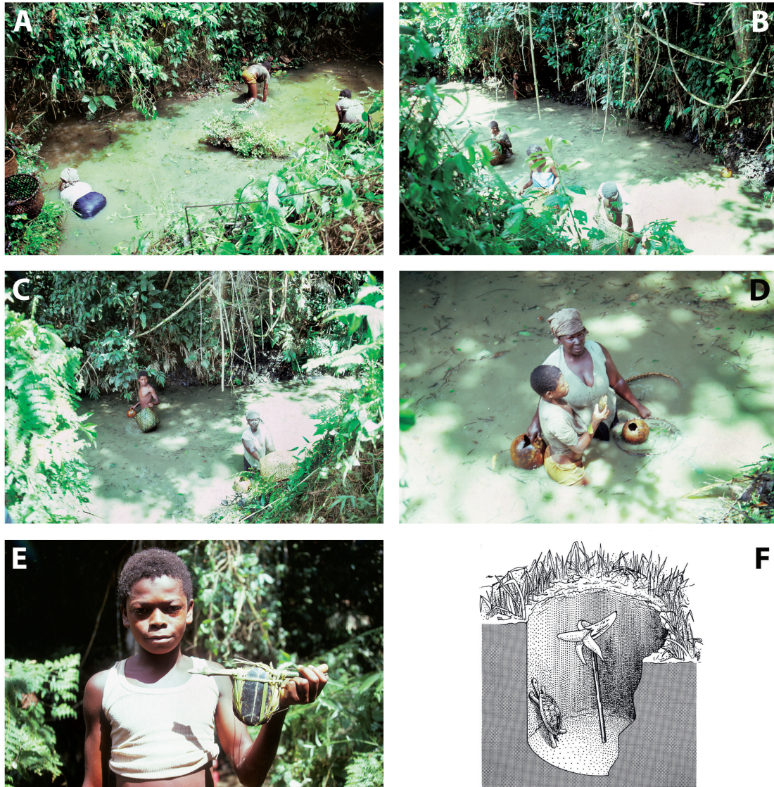
Figure 2. A. After the edges and overhanging vegetation have been cut back, debris is removed from the bottom during poziando near San José de Tagua. Photo: JE Simmons. B. Young people and children in the water “seining” with baskets. Photo: JE Simmons. C. Woman and young man with baskets and gourds for holding the catch. Photo: JE Simmons. D. Woman and boy examining the turtle they caught, Kinosternon leucostomum . Photo: JE Simmons. E. Young boy with a specimen of Rhinoclemmys melanosterna lashed by palm leaves to a stick for the trip home. Photo: JE Simmons. F. Diagrammatic view of a pitfall trap with a turtle.

holes were dug within 1-2 m of the shoreline of a section of oxbow with a grassy margin (the oxbow pool measured approximately 10 m x 80 m). Average dimensions of five pitfall holes were 394 mm ( \pm 56 mm) in diameter and 396 mm ( \pm 55 mm) deep.