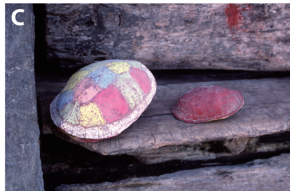
Figure 4. A. Young woman holding a canasto tortuguero used by her family to catch turtles. B. Diagrammatic view of a canasto tortuguero showing the single funnel entrance and balsa wood floats lashed to the side. C. Two painted turtle shells used as toys by children at Hacienda La Molinita. The shell on the left is that of Rhinoclemmys melanosterna , that on the right is Kinosternon leucostomum .

Pool cleaning ( poziando ) and the use of pitfall traps appear to be unreported techniques for the capture of turtles by traditional people in South America. These are techniques customized for the local conditions, in particular the lower water levels during part of the year, an important aspect of seasonal change in tropical environments that have often been part of the pattern in the exploitation of turtle