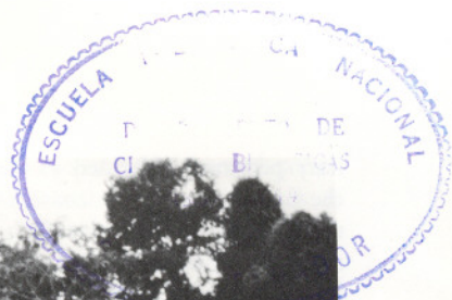
FIGURE 2. A bay in Laguna Zancudo Cocha, the largest blackwater lagoon in eastern Ecuador, with free-floating mats of the water hyacinth Eichhornia heterosperma. A single Amazonian manatee was observed by us here. This is typical of habitats where manatees occur in Ecuador.